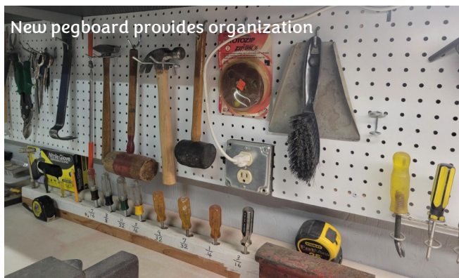
New pegboard provides organization

And peg board! They knew they wanted a peg board for hanging tools.